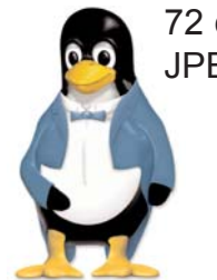
72 dpi JPEG

3. Generally, Tux is the same size or smaller than an IBM logo on the same page, and in a different corner of the page.