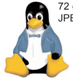
72 dpi JPEG

1. In the spirit of open source software, it's permissible to alter both regular Tux and Blue-suited Tux, but they should be tastefully rendered and not subjected to any compromising situations that may be deemed offensive. Any adaptation of Tux or Blue-suited Tux needs to be approved by Carminda Santana, WW Linux Marketing.