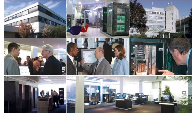
Böblingen and Mainz, Germany